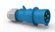
Option a) 200-240Vac, 4 pin plug (No neutral)