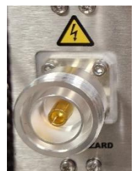
7/16 RF output