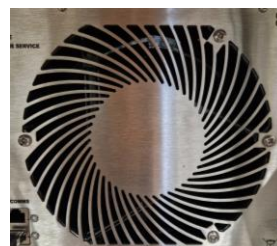
Smooth air exhausts